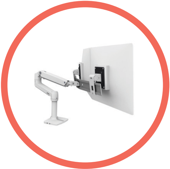
LX Dual Direct Arm

Shared workspaces can still be personalized. Adjustable, flexible designs fit each person's body for a comfortable workstyle.