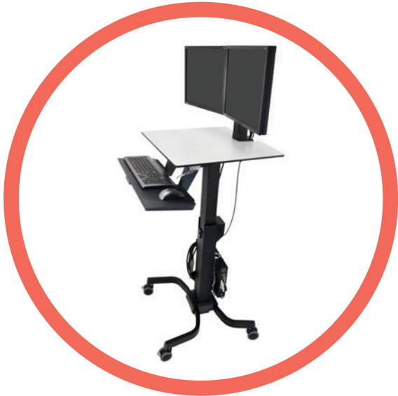
WorkFit-C Sit-Stand Workstation