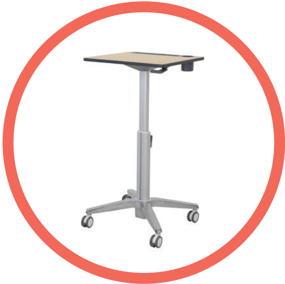
Ergotron Mobile Desk